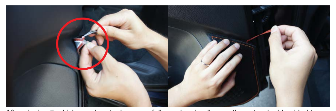
After placing the kick panel on to door, carefully peel and pull away the outer double-sided tape.